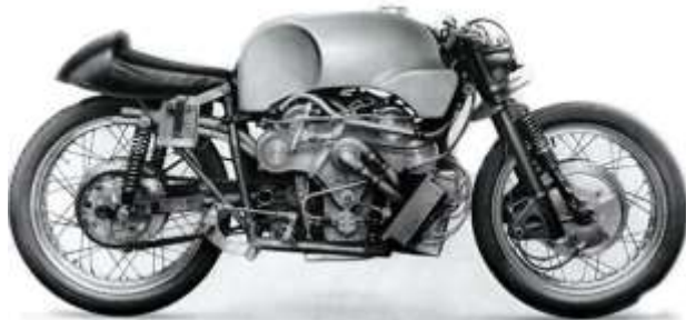
Guzzi Otto Cilindri 500cc V8 Racer