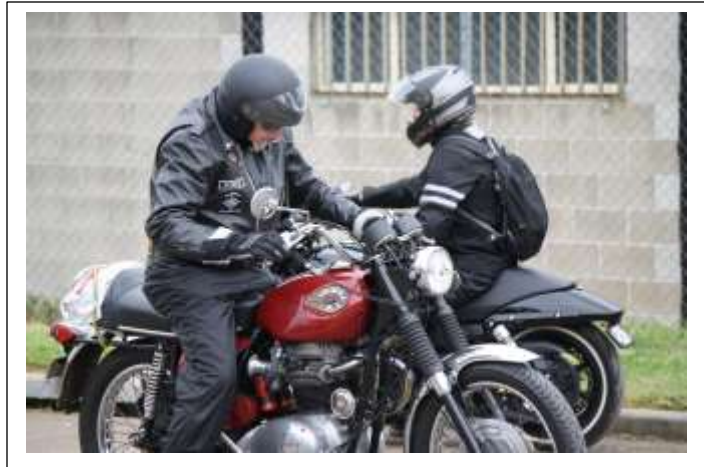
Photographs at the Workers Arena and leaving for Bungendore.