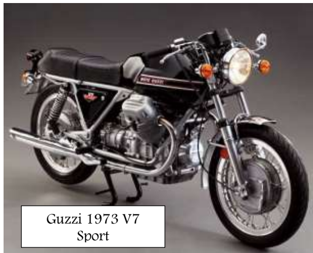
Guzzi 1973 V7 Sport