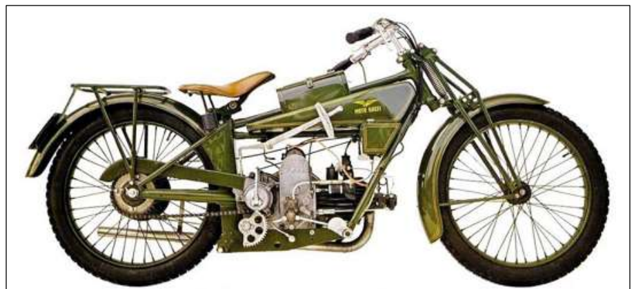
100 years of Moto Guzzi 15 March 1921 – 15 March 2021

Racing successes came in the Targa Florio in 1921, which marked the beginning of an impressive succession of victories. Up until its withdrawal from motorsports in 1957, Moto Guzzi accumulated a collection of titles, 14 GP championships and 11 Tourist Trophies.