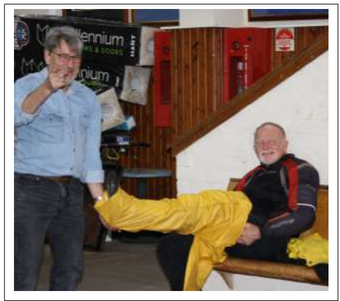
The challenges of wet weather – captured here in the faces and effort of 'task'. Is this trousers on? Or trousers off?