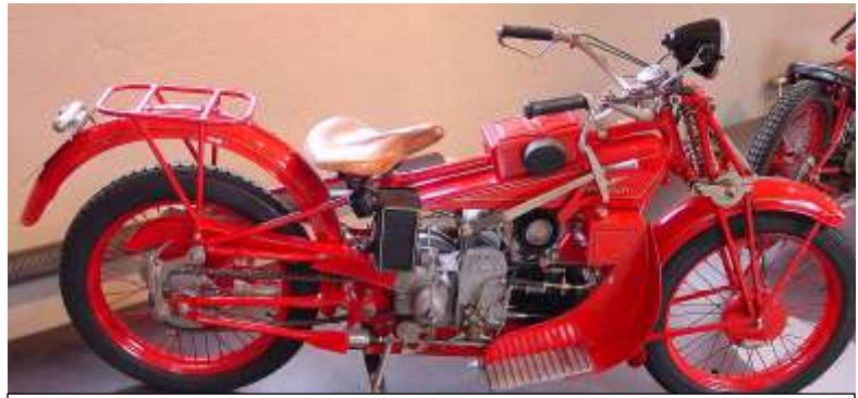
1928 Norge – driven 6,400 kms to Arctic circle in 1928